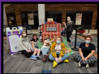
2022 B/CS Cookie Box Creations Team:- "Cookie Crafters"