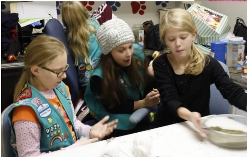
Making pet toys for the shelter. We also helped children including other scouts who came to the shelter make toys.