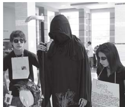
SADD students dress up to portray death. Students wanted to show what happens when you mix alcohol or drugs when driving.